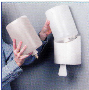
30 second replacement